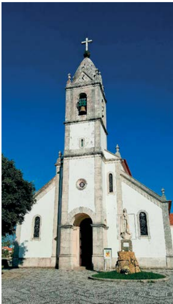
The little chapel where Francisco, Jacinta and Lucia were baptized

Not only is the eye witness testimony of the visionaries important, but also their words and especially their lives. They are the reflection as of a mirror of her presence on earth!